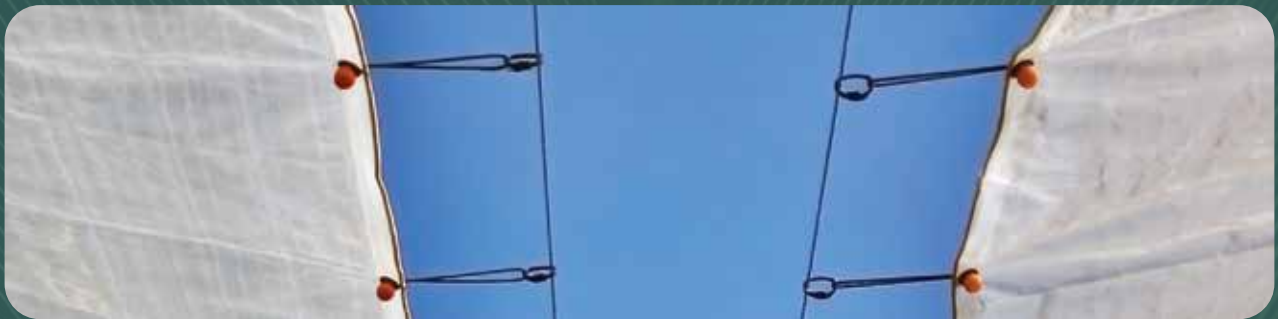
Oval Clip 21B

Note: Above technical data are mean values based on production and independent institute tests for guidance only.